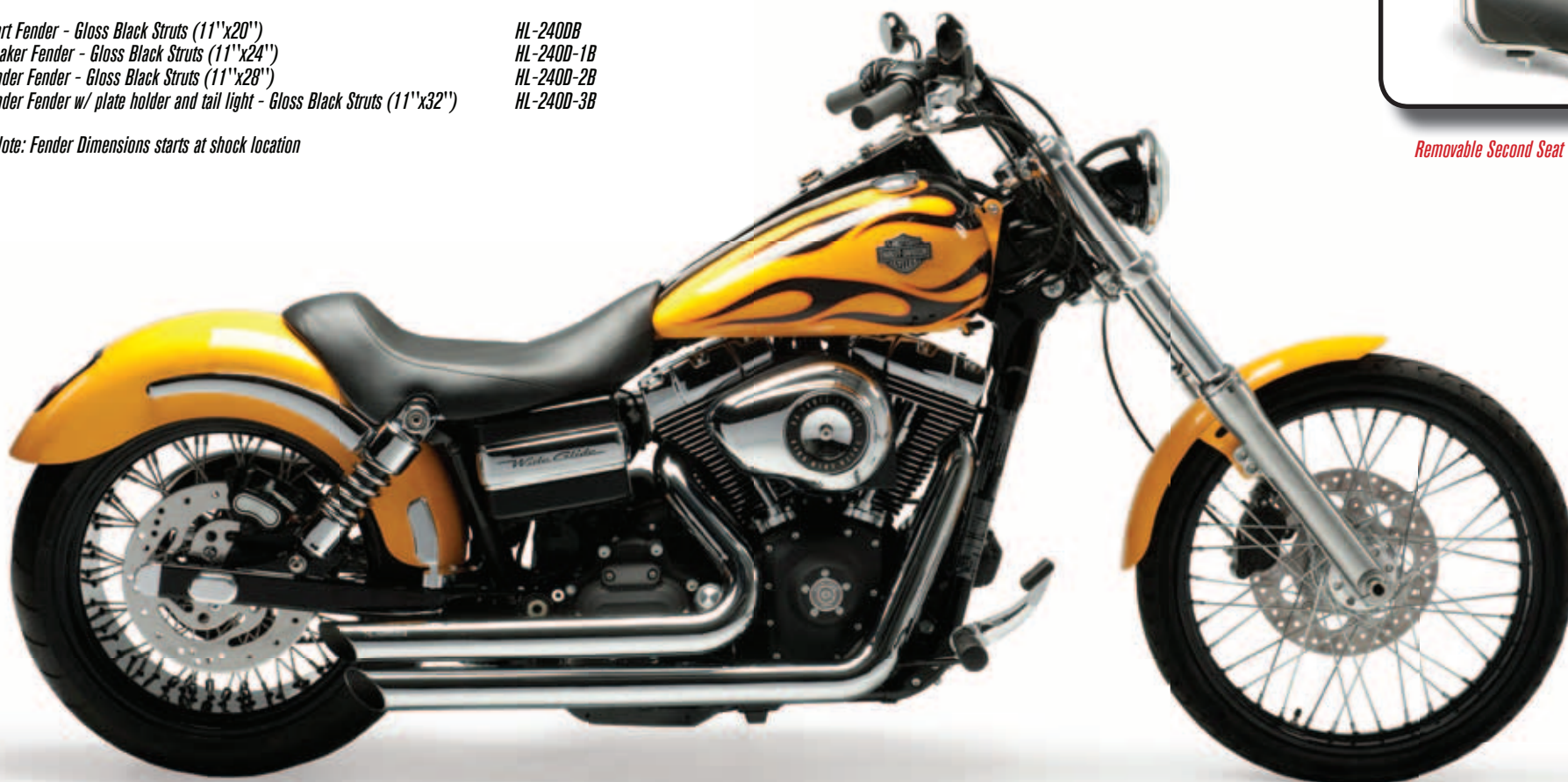
Shown: 240 D Conversion with Heartlander Fender with plate holder and tail light (HL-2400-3)