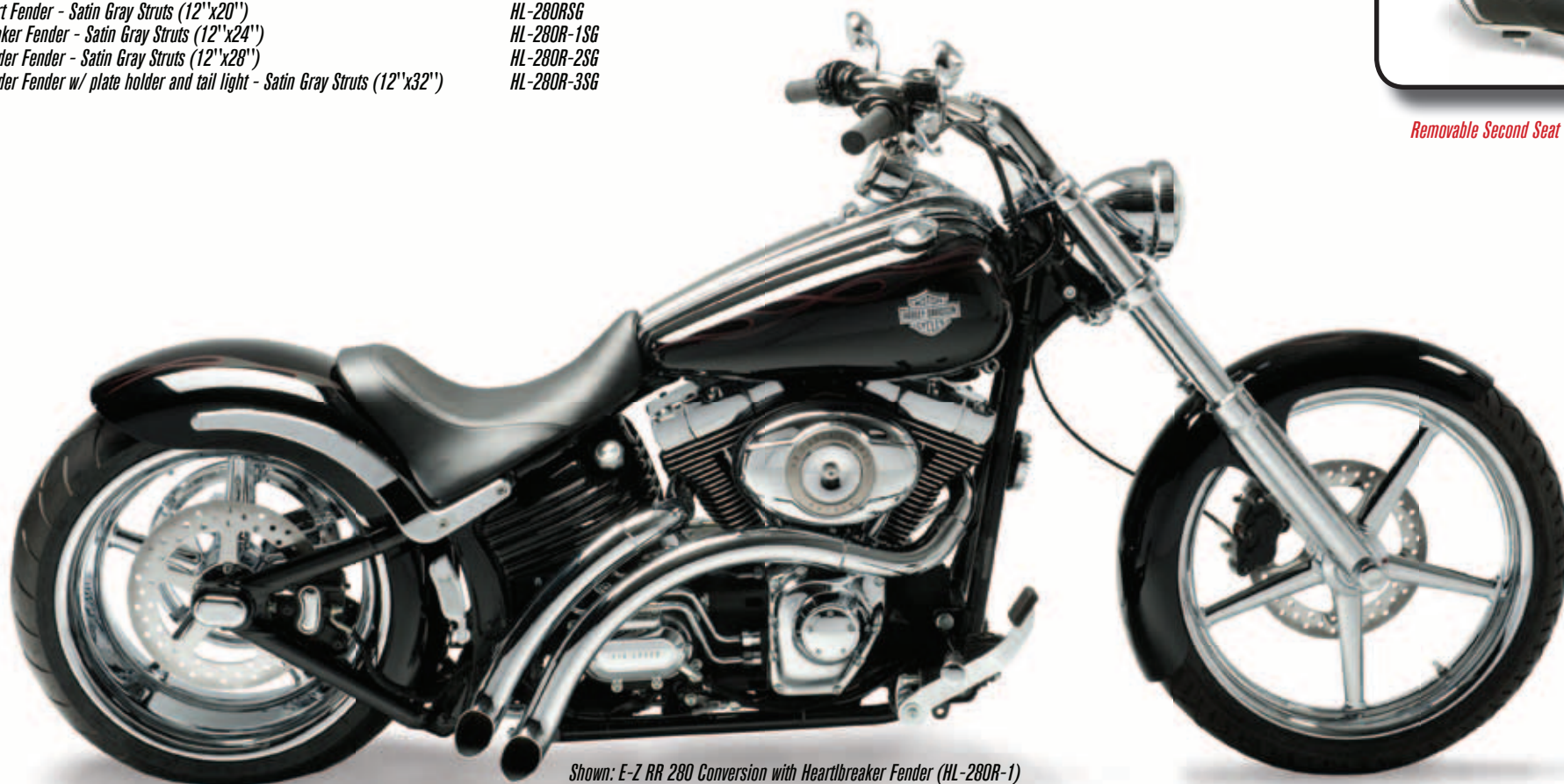
Shown: E-Z RR 280 Conversion with Heartbreaker Fender (HL-280R-1)