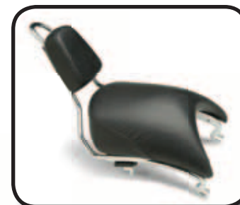
Removable Second Seat HL-2512

HL-280RSG HL-280R-1SG HL-280R-2SG HL-280R-3SG